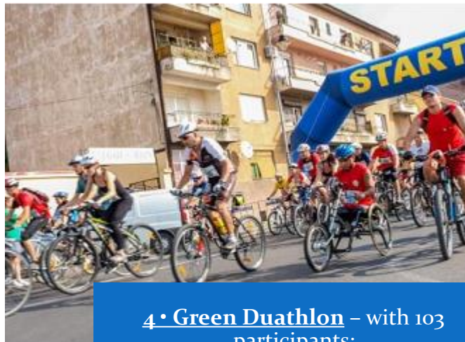
4 • Green Duathlon – with 103 participants;

The total number of participants on the events organised by the club, during 2013 have been 2042.